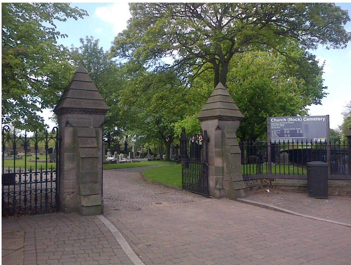
Nottingham Church Cemetery

Nottingham Church Cemetery contains 101 Commonwealth War Graves – 81 scattered burials from World War 1 & 20 burials from World War 2. From 1851, after the cemetery was laid out on the former sandpits, local people grew to know it simply as "The Rock". It is also known as Church (Rock) Cemetery on account of its sandstone rock faces and caves.