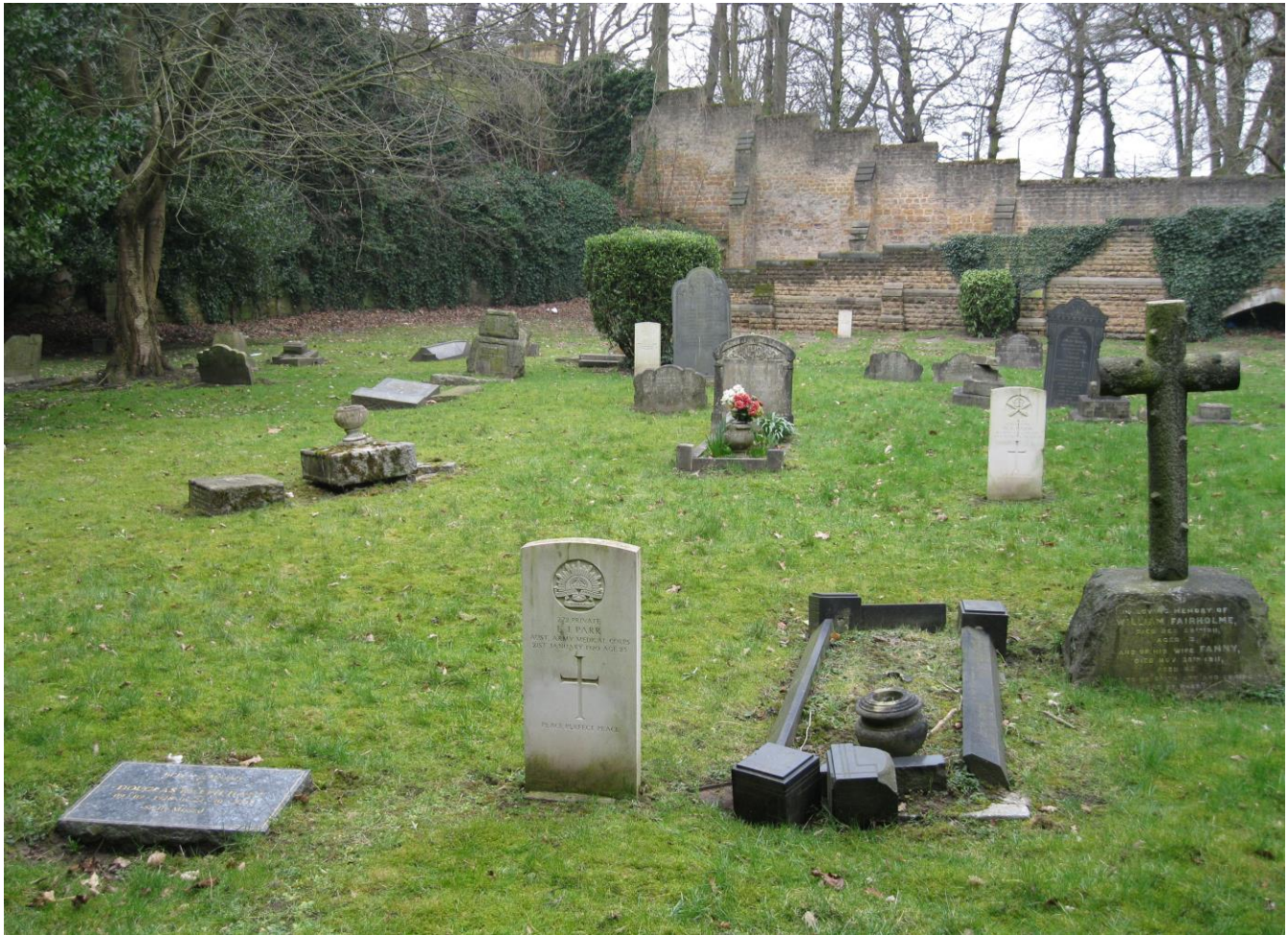
Nottingham Church Cemetery showing Pte E. I. Parr's Headstone